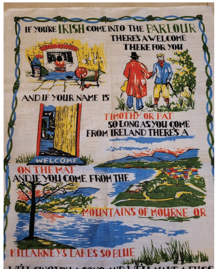
Above: Although linen souvenir towels are still being produced, mid-century examples such as this one are far more desirable.

Below: Cheers! One collecting category could be limited to all things related to Irish coffee.