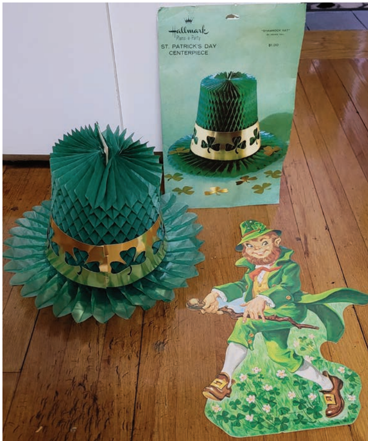
Above: Hallmark is for “when you care enough to send the very best,” or in this case, when you want to “wow” partygoers with a vintage honeycomb centerpiece.

Other Irish-related paper collectibles include vintage postcards. When compared to those made for other holidays, including Christmas, those intended for St. Patrick’s Day were made in limited numbers; as such,