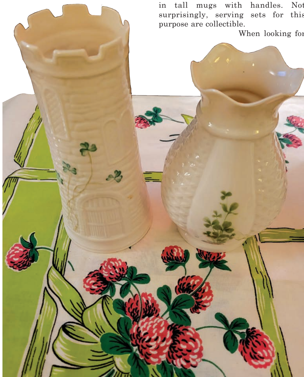
Above: Cherished by generations, examples of Belleek china are appreciated for their classic beauty.