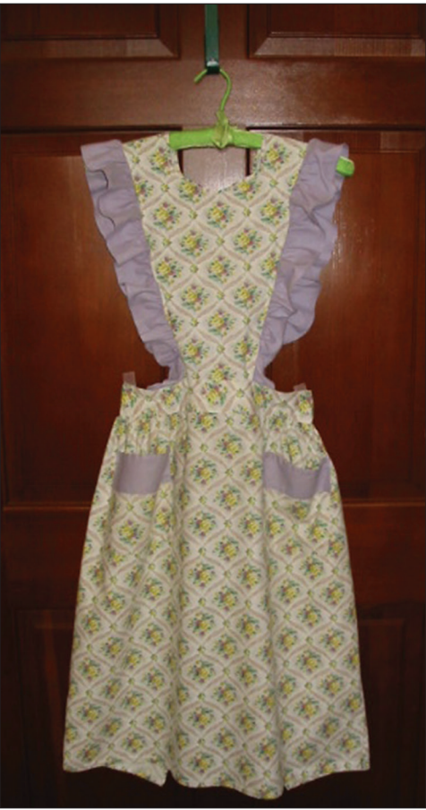
Above: A ruffled bib apron that, for the lucky woman with a small waistline, was very flattering as well as practical.