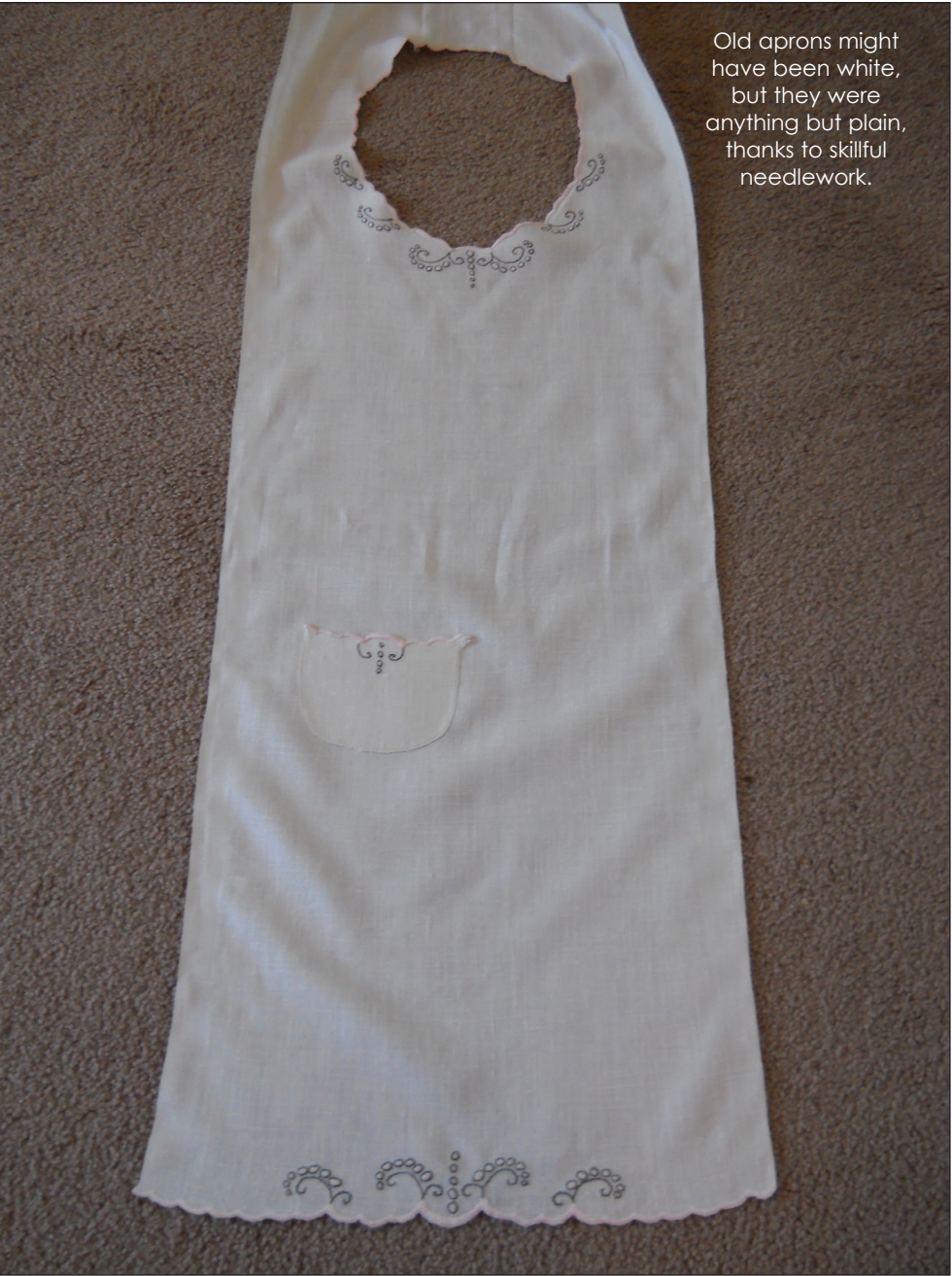
Old aprons might have been white, but they were anything but plain, thanks to skillful needlework.