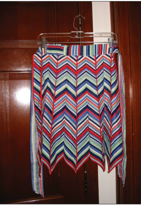
Above: So what was the function of the little pocket on the waistband of this apron? Maybe a place to stash a hankie?