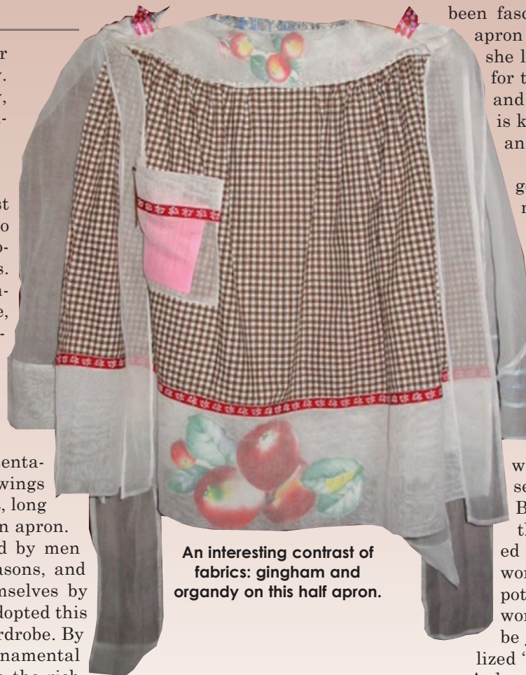
An interesting contrast of fabrics: gingham and organdy on this half apron.